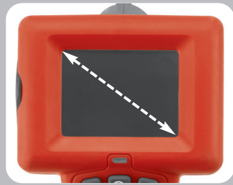
Crisp 2.4" LCD Screen