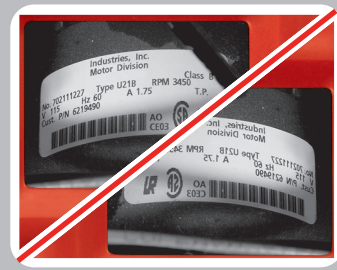
180° Digital Rotation