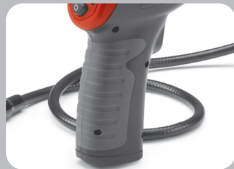
Pistol Grip Design for Easy One-Handed Operation