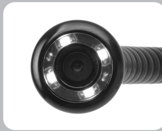
Waterproof Aluminum Imager Head and Cable with 4 Adjustable Ultra-Bright LEDs