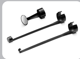
Hook, Magnet, Mirror