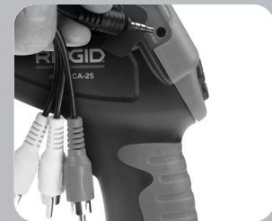
TV Out and RCA Cable