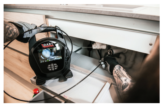
Specifications on reverse