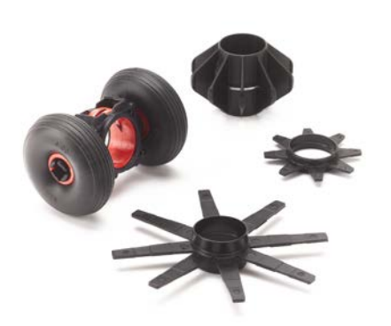
Set of 35 mm Pipe Guides included with SeeSnake Standard reel