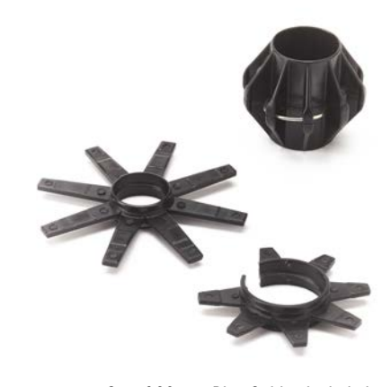
Set of 30 mm Pipe Guides included with SeeSnake Mini reel