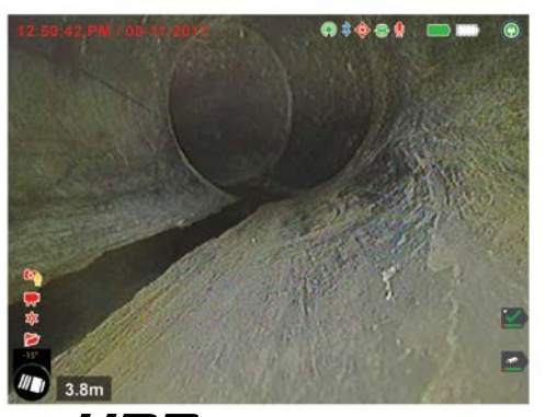
HDR IMAGE & TiltSense™